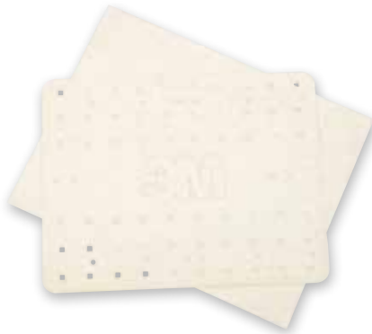
3M™ Flame Barrier FRB Series

In addition to its flame-resistance and electrical properties, the 3M flame barrier is very thin, allowing low-profile designs. And, the specially formulated barrier material can be easily die-cut to specifications, enabling a wide array of diode patterns. This is a clear advantage over mica-based flame barriers, which are less easily die-cut because the mica shards can easily break off during the cutting process.